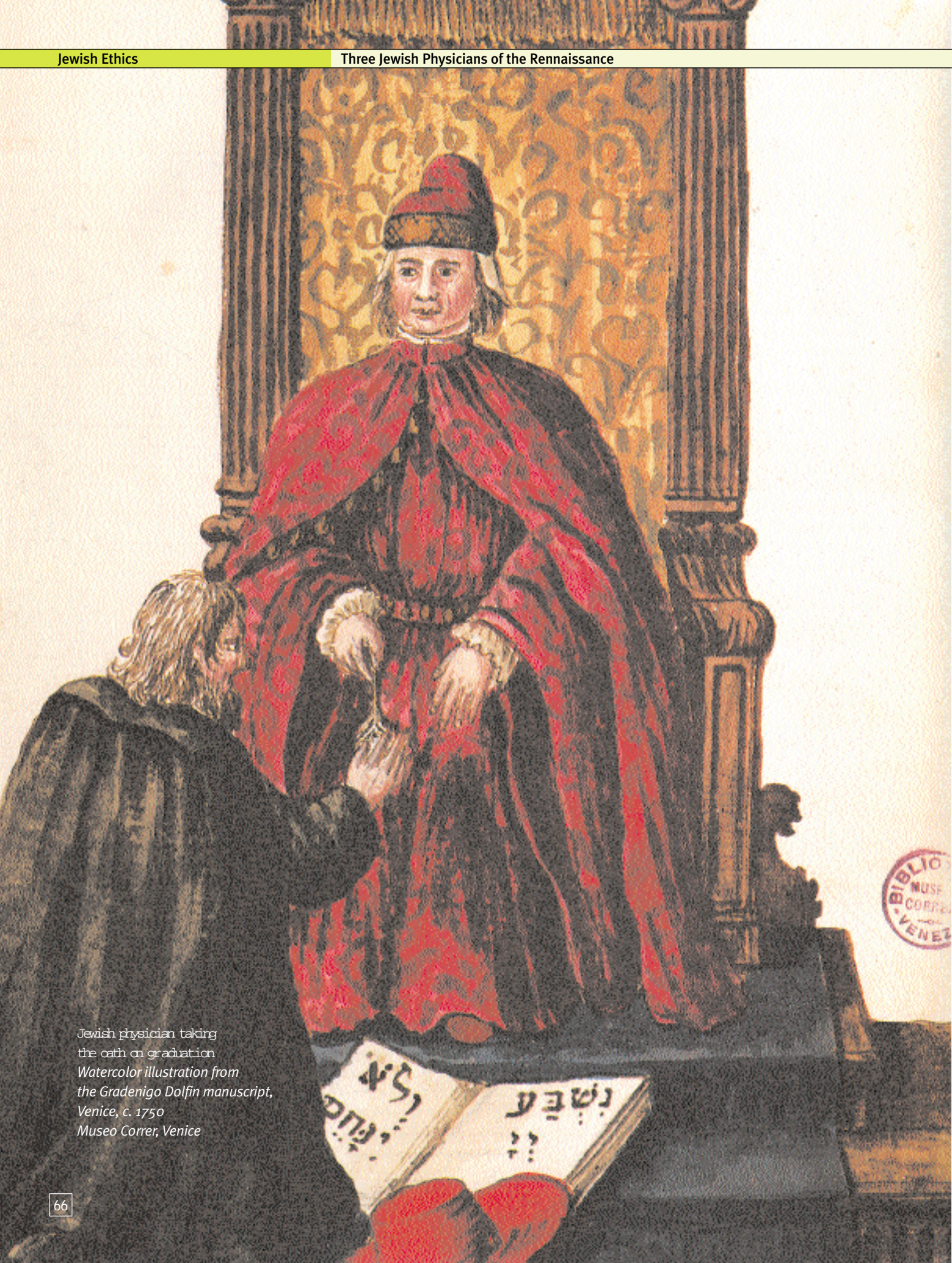
Jewish physician taking the oath on graduation Watercolor illustration from the Gradenigo Dolfin manuscript, Venice, c. 1750 Museo Correr, Venice