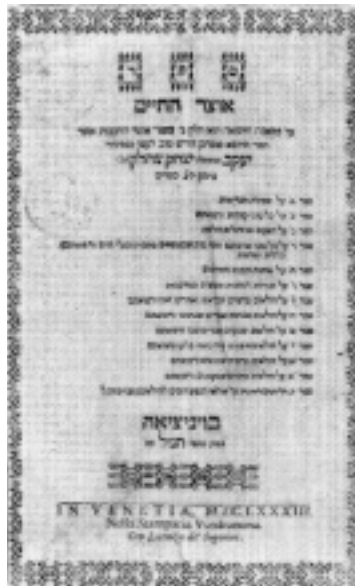
Title page of Otzar ha-Chayyim by Jacob ben Isaac Zahalon. Venice, 1683

Abraham Zacuto was the central figure among Jewish doctors in the 17th century just as Amatus was in the 16th century. His life story, like that of Amatus Lusitanus or Judah Abravanel, is another example of a brilliant ethical thinker, working and writing against a background of exile and despair. Abraham Zacuto, who was born in 1576 to a Marrano family in Lisbon, was the great-grandson of Abraham Zacuto, the renowned astronomer and physician, inventor of the astrolabe and the inspiration for Vasco da Gama and, perhaps, for Columbus.