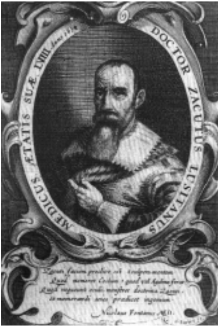
Zacutus Lusitanus (Abraham Zacuto, 1575–1642).

He studied medicine in Salamanca and Coimbra, returned to Lisbon and practiced medicine there for 30 years. In 1624 Zacuto fled to Amsterdam and joined the Jewish community. While in Lisbon he did not publish a single book, whereas in Amsterdam he became an extremely prolific writer. Zacuto was the author of the highly popular De Medicorum Principum Historia , (twelve volumes). His other publications were also of significance and popular in his time. His most important essays were collected in Opera Omnia (two volumes) and published after his death (in the 1640s) at Lyon. This remarkable work went through five editions and was extensively quoted by medical authors for many years. Although the work was written in Latin and addressed to a Christian audience, in the introduction he emphasizes his Jewish origin: